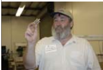
Richmond Development Co. hosted a mixer at Richmond Plastics, Pt. Richmond Granite Marble Cabinetry and Bark Stix (not shown).