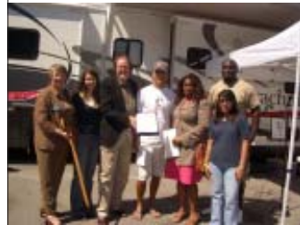
Parachute held a double Ribbon Cutting to inaugurate their almost new offices (top picture) and to launch the Parachute Bus on its way to visit 50 colleges in the next year.